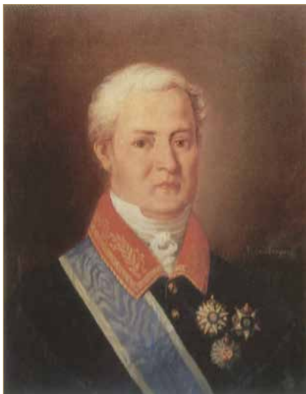
Portrait de Henrique de Teixeira Sampaio, 1er comte de Póvoa, attribué à Tony de Bergue, vers 1850, Collection du Secrétariat général du ministère portugais des finances, Lisbonne