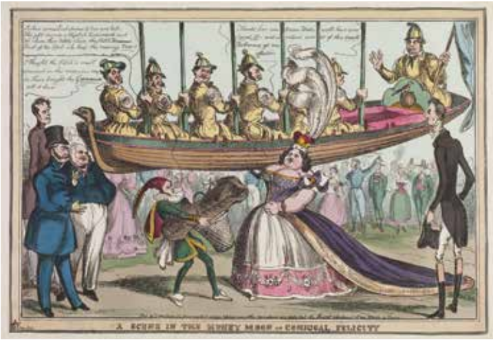
Une scène de la Lune de miel ou de la Félicité conjugale, par "Paul Pry" (William Heath), 1828.