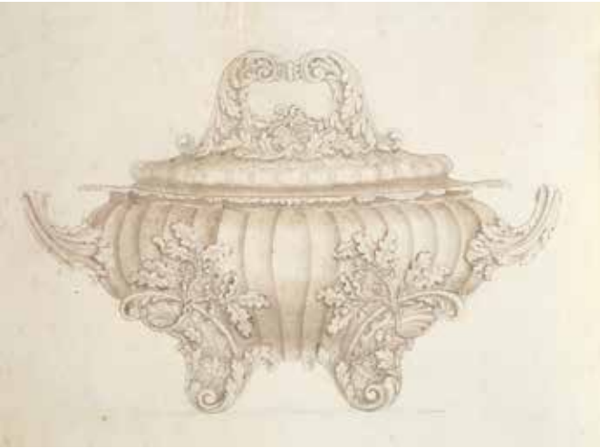
Dessin pour une soupière, attribué à Edward Hodges Baily, Victoria & Albert Museum, Londres (inv. E.70-1964)