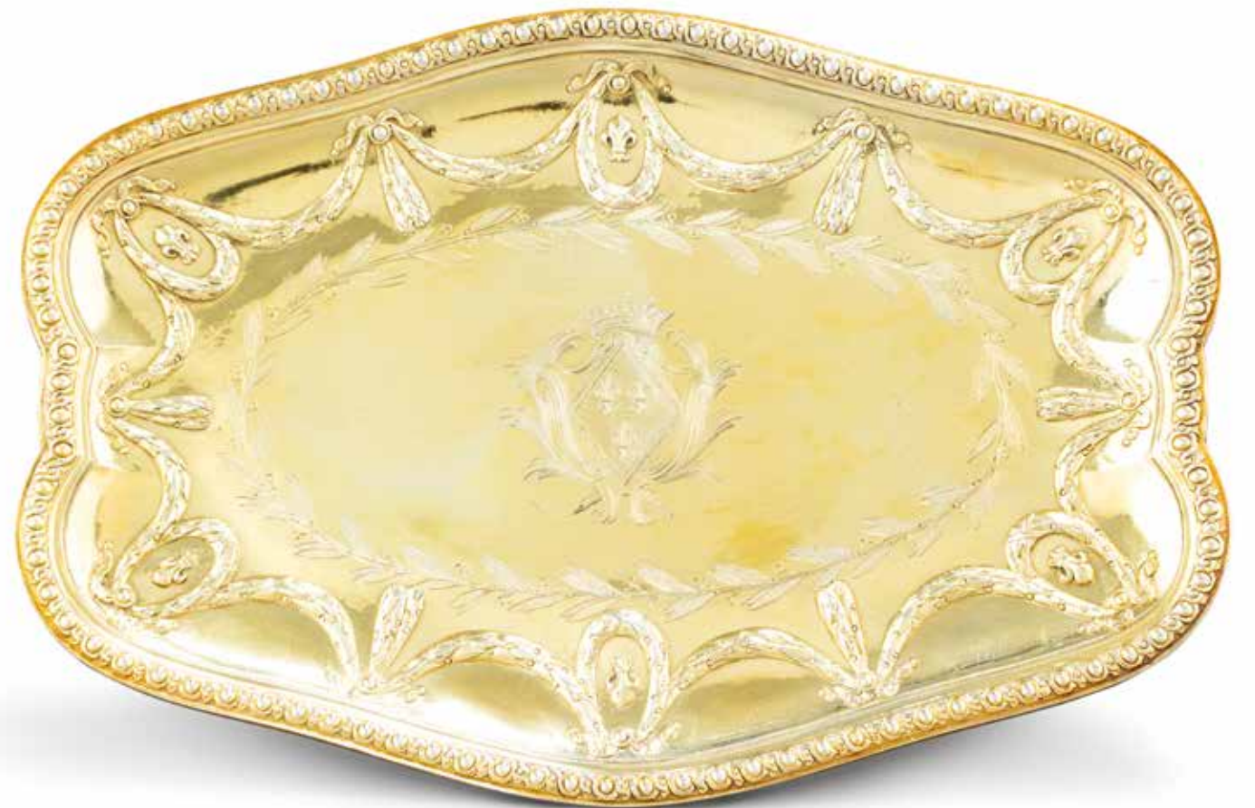
Gravée aux Armes Royales de France