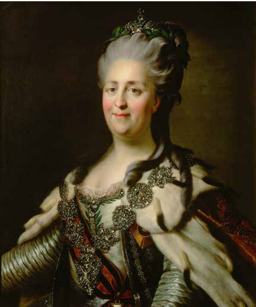
Catherine II by J.B.Lampi (1780s, Kunsthistorisches Museum)

At the head of Russia since 1762, Catherine II was a reforming monarch. In order to govern such a vast country, she developed a large reform of the provinces from 1775 with the help of her favorite Gregori Potemkin. She divided Russia into fifty provinces, each headed by a governor, who was responsible for administration, police and justice, while being linked to the central power. To reward the best governors she had twenty silver dinner services made in all the most important European capitals, Paris and London, but also Augsburg and St Petersburg. These services were then installed in the palaces of the provinces in order not to be mixed. In addition to the six services ordered in Paris from Robert-Joseph Auguste from 1778 and the five ordered in London from 1774, the Augsburg silversmiths received orders for probably six services: Perm, Kharkov, Blonec, Riga and two others undefined.